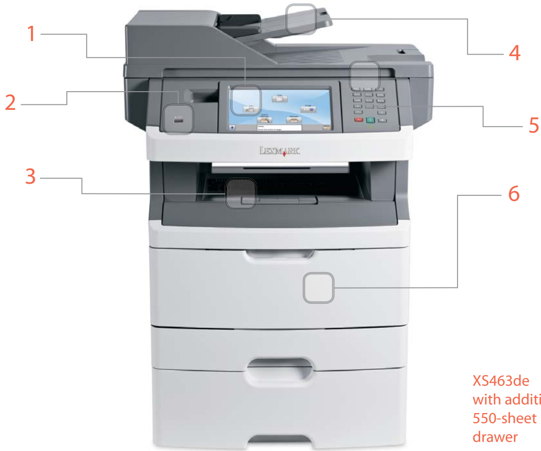
XS463de with additional 550-sheet drawer