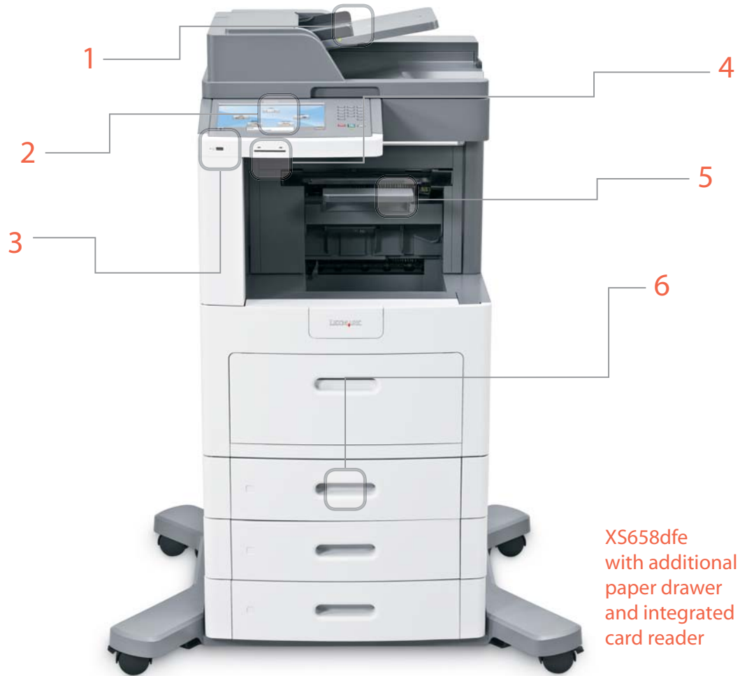
XS658dfe with additional paper drawer and integrated card reader